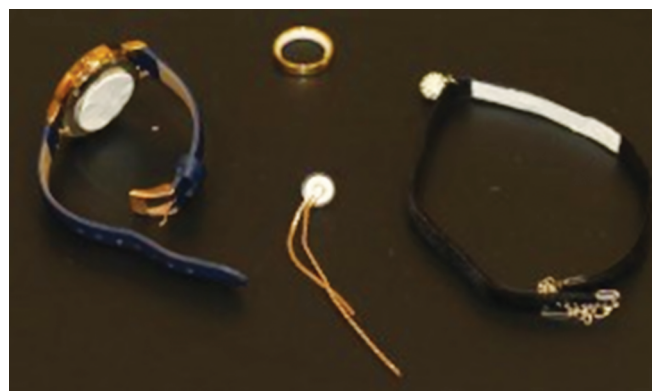
Fig. 1: Contraceptive jewellery

Figure 1 shows the contraceptive jewellery, like a pharmaceutical watch, ring, choker necklace, and earring. A white contraceptive