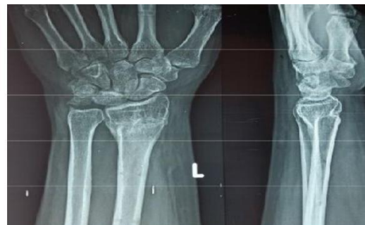
24 WEEKS FOLLOW UP