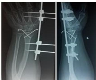
6 WEEKS FOLLOW-UP